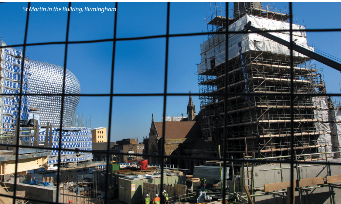
St Martin in the Bullring, Birmingham

If you have any additional questions please contact the Grants Team at grants@nationalchurchestrust.org or via our office on 020 7222 0605 or at 7 Tufton Street, London SW1P 3QB