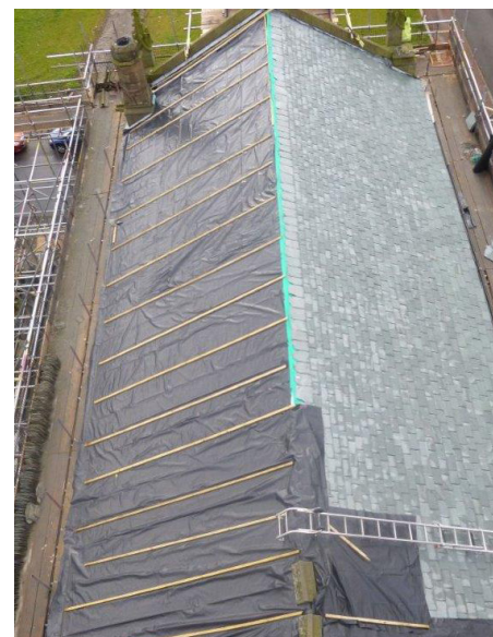
St Chad's church, Bensham, Northumberland