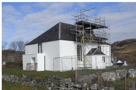
Colonsay parish church, Isle of Colonsay, Scotland

If you need funding for a church repair project, want to install a toilet, kitchen and improve community facilities, or are seeking early stage funding (such as for a feasibility report) for your place of worship, then the National Churches Trust grant schemes can help you.