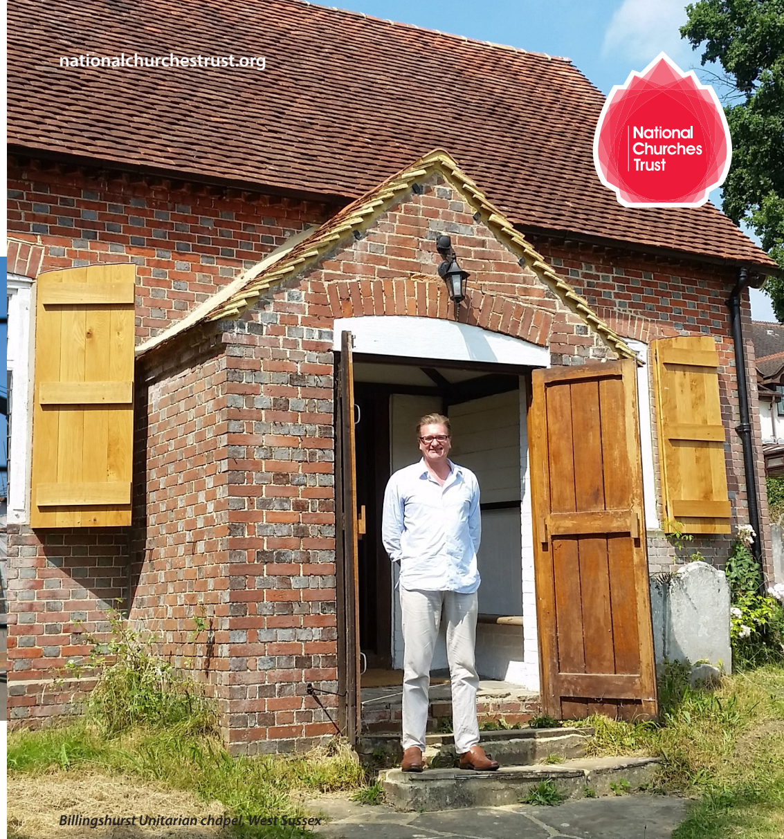
Billingshurst Unitarian chapel, West Sussex